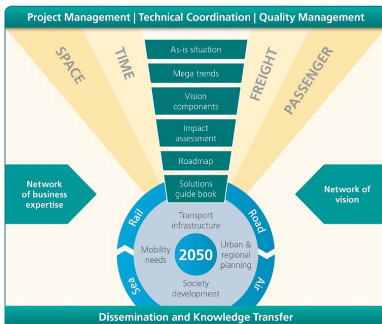
Overview of the SPIDER PLUS project approach

massive shift of traffic to rail. In the long-term, more than 50% rail market share are the set goal for both rail passenger and rail freight transport. This is considered a very demanding goal while it is not clear yet how to achieve this objective.