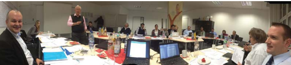
Panorama photo of the SPIDER PLUS back casting workshop in Hanover

Or visit the project website: www.spiderplus-project.eu